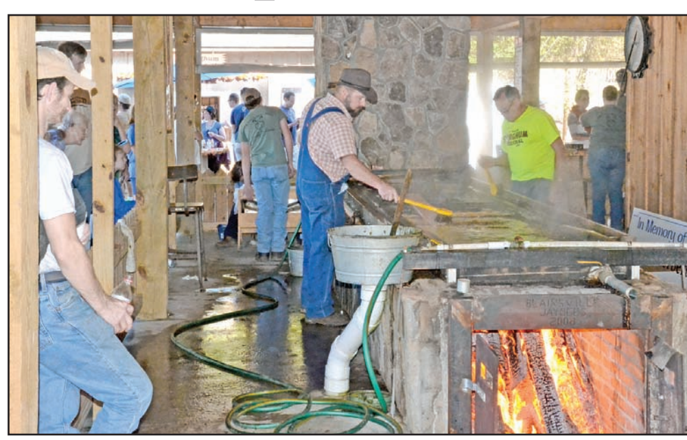
Cooking Sorghum at last year's Sorghum Festival

Community groups, as See Sorghum, Page 2A